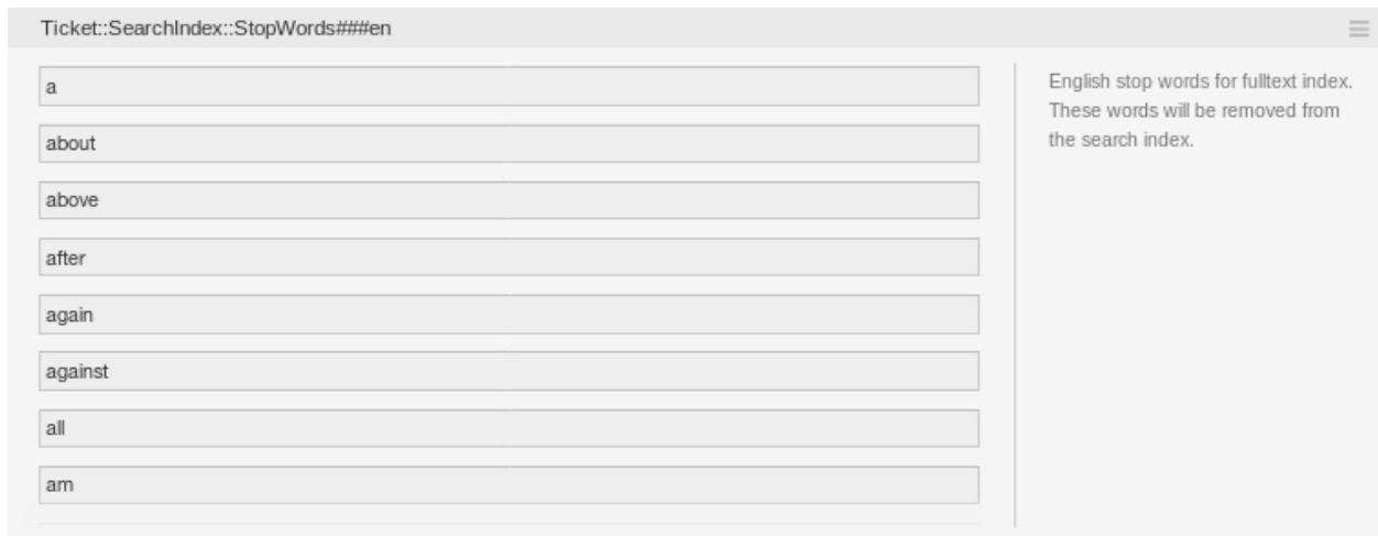
Fig. 3: Ticket::SearchIndex::StopWords###en Setting

Ticket::SearchIndex::StopWords English stop words for full-text index. These words will be removed from the search index.