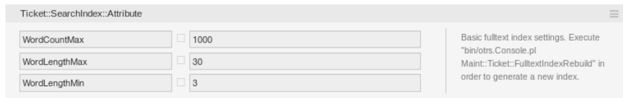
Fig. 1: Ticket::SearchIndex::Attribute Setting

Ticket::SearchIndex::Attribute Basic full-text index settings.